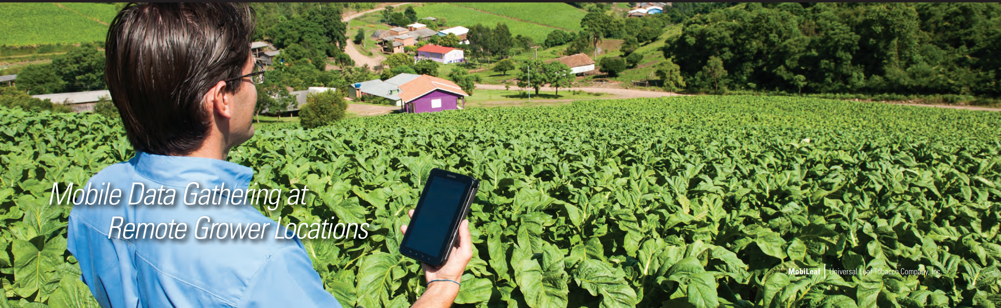
Pictured Above: Training farmers on how to utilize the MobiLeaf™ app in the field

Mobile Data Gathering at Remote Grower Locations